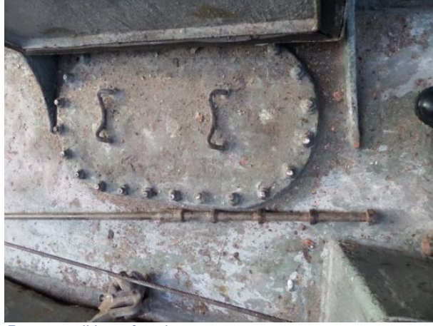
Poor condition of tank cover

It is imperative that the risk assessment which forms the basis for the safety procedure and control measures should include the entire work process required for returning the vessel to its original safe condition upon completion of the task and not just limited to the main task at hand. It is also important that the permit to work is fully verified before closing out.