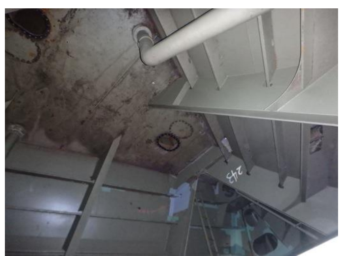
Inaccessible side tank covers

Manhole covers on vertical bulkheads, such as those on wing tanks or side tanks of container ships, are generally located close to the bottom of the tank meaning that leakage from the cover is found only after the tank has been filled to a certain head. This makes it even more difficult for the manhole cover to be secured until the contents of the tank have been transferred from the tank to stop the leakage.