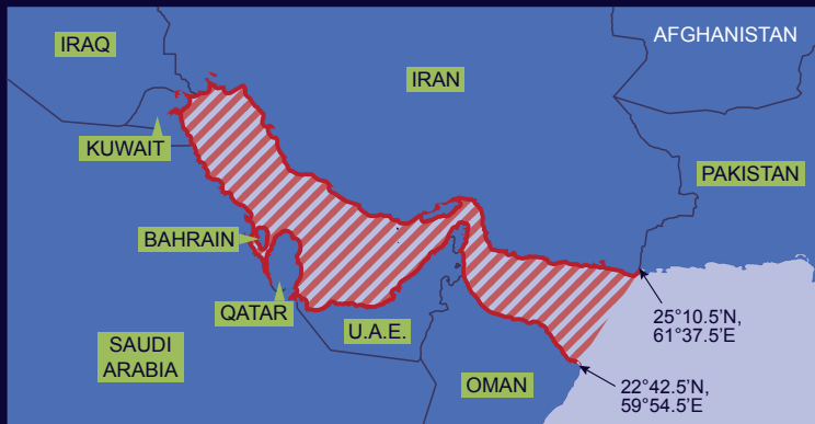
(i) Persian/Arabian Gulf and adjacent waters including the Gulf of Oman and waters west of the line from Oman's territorial limit off Cape al-Hadd at 22°42.5'N, 59°54.5'E northeast to the Iran-Pakistan border at 25°10.5'N, 61°37.5'E