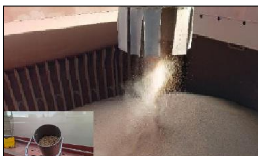
Figure 7: Example of effective monitoring.

Cargo loading must not be conducted during periods of precipitation. All cargo holds should remain securely closed and adequately protected to prevent introduction of external moisture throughout the loading process. It is important to record the ambient temperature of the cargo at the time of loading, as temperature data is a critical parameter for monitoring cargo condition during transit.