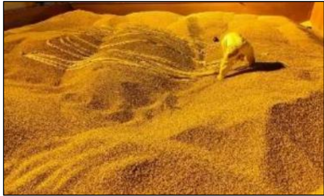
Figure 8: Fumigator-in-charge must ensure careful dosage, distribution and even placement of fumigant sleeves.

Safe fumigation practices require that the treated space be rendered completely gastight for the entire exposure period.