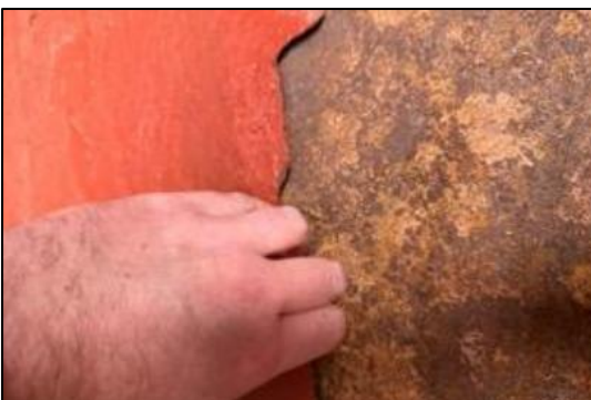
Figure 1: Example of flaking rust and paint

Before loading, it is essential that all cargo holds are prepared to meet Grain Clean standards, which represent the level of cleanliness required for food grade commodities. This means the holds must be completely free from insects, odours, residues of previous cargoes, lashing materials, dunnage, loose rust scale, paint flakes and any other foreign matter that could contaminate the grain. Particular attention should be given to removing any loose scale or flaking paint, as these can detach during the voyage and mix with the cargo, which is unacceptable under Grain Clean standards. The cleaning process should include thorough sweeping of all surfaces, followed by washing down with fresh water to remove any rust and salt deposits.