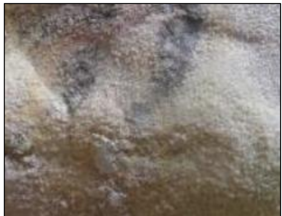
Figure 10: Example of damage due to mould

Grain is hygroscopic, meaning it naturally absorbs and releases moisture. So, effective ventilation management is key to prevent moisture damage to the grain cargo during the voyage. Improper ventilation can lead to the formation of ship's sweat or cargo sweat, both of which cause serious and extensive cargo damage, including mould growth, caking and self-heating. Grains, like other agricultural products, undergo metabolic respiration during storage and generate heat. While the intensity of this process is influenced by the grain's natural moisture content, any increase in moisture within the cargo hold can accelerate respiration, resulting in elevated temperatures that promote heat damage and mould contamination.