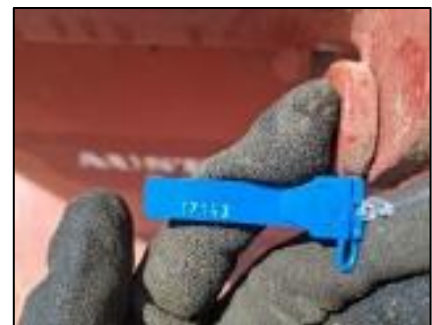
Figure 9: Cargo hold sealed using tamper proof seals with serial number.

In such cases, the circumstances must be fully documented, including accurate logbook entries and clear photographic evidence and all relevant cargo interests must be promptly notified.