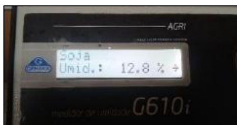
Figure 5: Monitor and record cargo moisture content.

Lower moisture limits are needed for certain voyages depending on the destinations in relation to the climate, duration of voyage and carriage. Excessive moisture content in the cargo significantly increases the natural respiration rate generating heat within grain, causing self-heating and creating conditions that promote mould growth, rotting and caking.