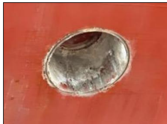
Figure 2: Residues from previous cargo in cement loading hole, leading to cargo hold rejection.

In addition to structural checks, the bilge pumping system should be tested to confirm that it is functioning properly, including the performance and integrity of each component including pipes, valves, expansion joints and non-return valves in the system. Furthermore, bilge wells should be clear of obstructions and be covered with burlap or another suitable material, securely fastened in place.