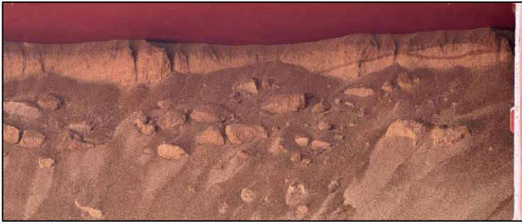
Figure 11: Cargo lumps and cake formation indicating wetting damage.

Ventilation must be done if the dew point temperature inside the hold is higher than the dew point temperature of the air outside. Where entry into the cargo hold is not possible, the "Three Degrees Rule" may be used. In this rule, the dry bulb temperature of the outside air is compared with the average cargo temperature at the time of loading, and ventilation is needed if the outside air is three degrees cooler than the average loading temperature of the cargo.