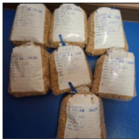
Figure 6: Example of well labelled and documented representative samples taken during loading.

During loading operations, it is essential to implement a systematic sampling procedure to ensure representative samples are collected and maintained. It is highly recommended to appoint a competent surveyor to oversee this process and assist with general loading operations. Ensuring that all samples are clearly labelled, well-documented and preferably collected jointly with cargo interests can be pivotal in defending the vessel's position should a claim arise. Sampling can be performed manually or through automated systems that continuously collect samples from the conveyor belt during loading. In addition, it is recommended that the moisture content of the cargo is verified by an independent inspector or laboratory. The Club should be notified and formal protests lodged with all cargo interests, should there be deviations from specifications provided by the shipper.