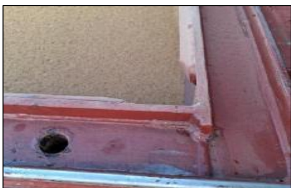
Figure 4: Hatch coaming, drainpipes and non-return valves

When planning fuel oil distribution, special attention is be given to tanks that require heating. Avoid heating fuel oil tanks adjacent to cargo holds as heat transfer can raise the temperature within the cargo spaces, potentially causing heat damage to sensitive grain shipments. Proper planning may ensure heated tanks are positioned away from cargo holds, minimising the risk of heat related deterioration and maintaining cargo integrity throughout the voyage.