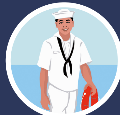
Ginto - The Able Bodied Seaman