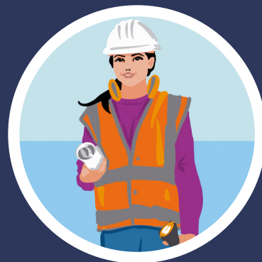
Indica - The Third Engineer

Mental Health Support Solutions GmbH info@mentalhealth-support.com