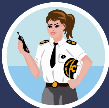
Athena - The Chief Officer