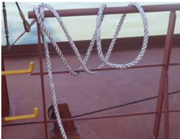
Unapproved secondary means of support tied to non-loading bearing part of accommodation ladder and vessel structure

AMSA has observed that secondary means of support arrangements have consisted of the following: