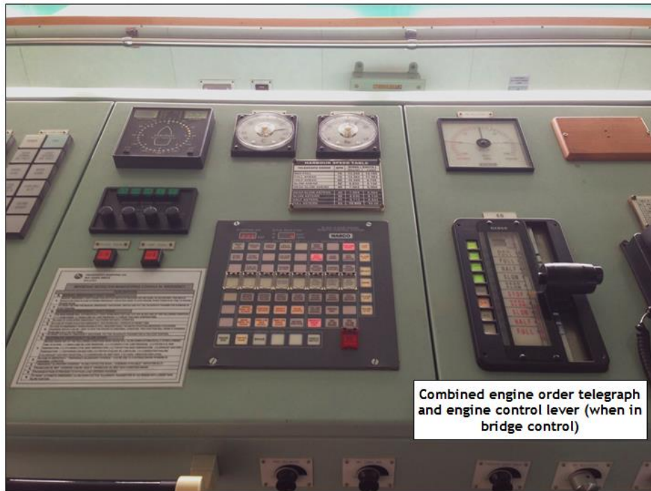
Anna Smile bridge engine control.

At this time, the Anna Smile was parallel to the pier, about 30 feet away, and moving very slowly at about 0.1 knots astern. Both tugboats were set up perpendicular to the Anna Smile on the ship's port side. Two mooring lines were lowered from the starboard side of the Anna Smile ; two line-handling boats retrieved these lines, transferred the ends to the pier, and secured the lines to bollards.