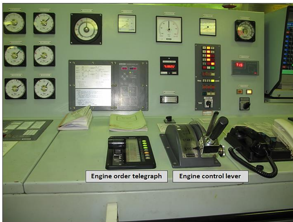
Anna Smile ECR engine order telegraph and main engine control lever.

next order was dead slow astern, but when the chief engineer moved the engine control lever, the engine failed to remotely start as expected. Two more astern commands were given from the bridge—slow astern and half-astern—both with no response from the engine, despite the chief engineer's command inputs to the engine control system. The chief engineer did not advise the captain that he was having difficulty starting the engine.