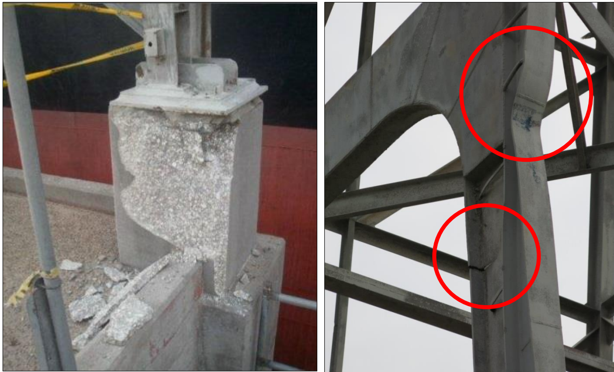
Close-up of a damaged concrete pedestal (left) at the Louis Dreyfus Grain Elevator and a cracked weld and bent I-beam on a vertical support (right).

The Anna Smile sustained minor scraping and a 2-inch inset of the hull plating for about 11 frames (30 feet) as the ship moved forward while in contact with the grain elevator. The damage estimate for the ship has yet to be determined, but the classification society recommended that the insets be repaired by June 2017, which is the next regularly scheduled dry-dock period.