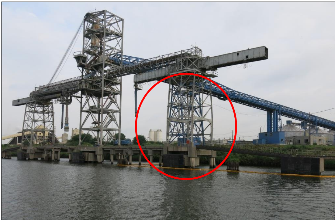
Louis Dreyfus Grain Elevator east tower, which was damaged in the allision.

Damage to the grain elevator's east tower was estimated at $2.5 million. Horizontal and vertical steel structural supports on the grain elevator's structure were damaged, concrete pads were cracked, and a rubber fender was bent from the impact. To repair the elevator tower, contractors were required to remove and replace the entire upper section of the tower from the base, including the conveyor and carousel; fabricate four new legs of the lower structure; repair the bent fender and bent steel in the upper section; and replace the damaged concrete pedestals and dock area.