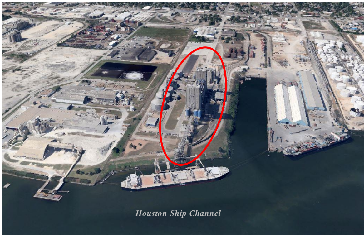
Site of the Louis Dreyfus Grain Elevator, circled in red. Vessel pictured is not the Anna Smile.

About half a mile from the grain elevator dock, two tugboats arrived to assist the vessel to its berth. The Hayden II was secured with two lines to the Anna Smile 's port bow in the area of cargo hold #1, and the Captain W.D. Hayden was secured with two lines at the stern on the port side just forward of the superstructure.