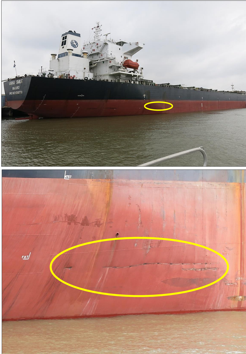
Damaged area of Anna Smile hull (top) and close-up of vessel frames 41–52.