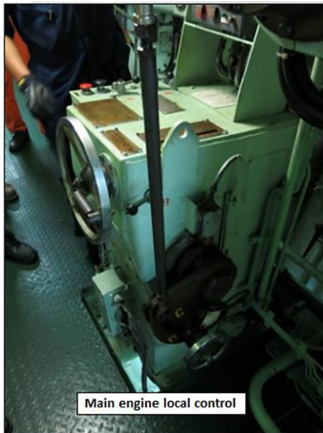
Local control station at the side of the main engine.

After completing the steps to engage the local control station, the chief engineer started the engine at the dead slow ahead speed of 40 rpm despite the current stop command. Dead slow ahead was the last command that he was aware of before leaving the ECR, but the command had changed from ahead to stop while he was changing the engine control mode. The engine continued to run in the ahead direction for about 1 minute until the chief engineer was told to stop the engine by the second engineer who ran down from the ECR and relayed the stop command he had received from the bridge via the ECR phone. When the chief engineer was asked why he did not use the local phone located directly behind him, he stated that the bridge called the ECR and it was too loud in the machinery space to hear the local phone behind the emergency control station.