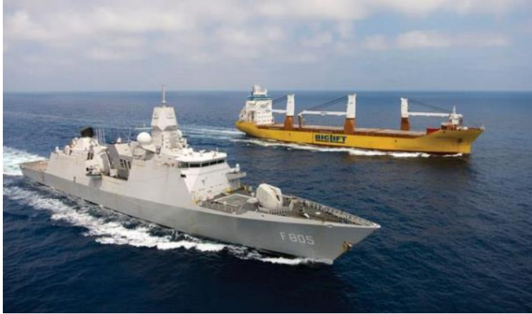
Figure 2 Accompaniment Strait of Hormuz

Naval Cooperation and Guidance for Shipping (NCAGS) is the link between the merchant shipping and the Navy. NCAGS has a de-escalatory posture with as goal: Autonomous Maritime Situational Awareness, Contribute to Freedom of Navigation, and Reassure shipping.