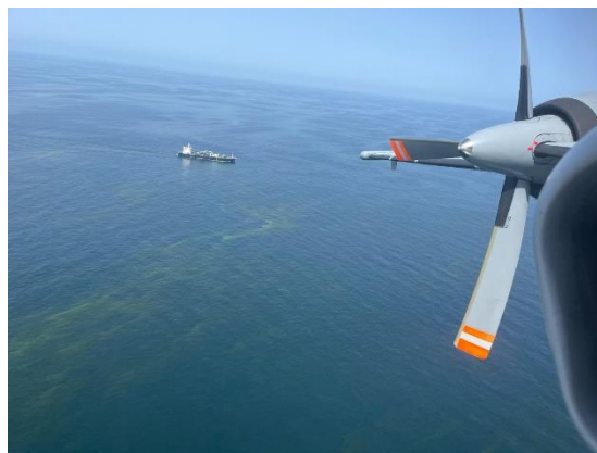
Figure 5 the MPA Atlantique 2 on a patrol flight conduction reassurance calls to a VOI.

One of the priorities of EMASoH is to provide reassurance to ships in order show EMASoH ensures the freedom of navigation in the Gulf region. In order to do so the MPAs conduct so-called reassurance calls, 98 of these calls were carried out in March.