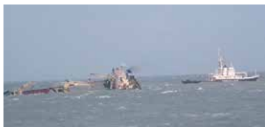
Vessel listing during salvage attempt

A salvage operation started the next day, but the vessel capsized and sank four days later.