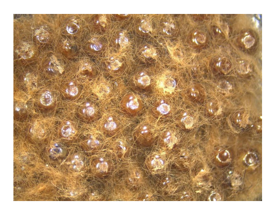
This is a closeup of an Asian Gypsy Moth mass. Each mass can contain hundreds of eggs that produce pests, which eat the foliage of more than 500 tree and shrub species.

"Once again, our agriculture specialists used their experience and outstanding attention to detail to