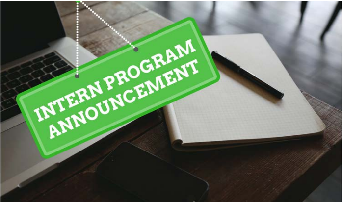
Intern in the Travel Section