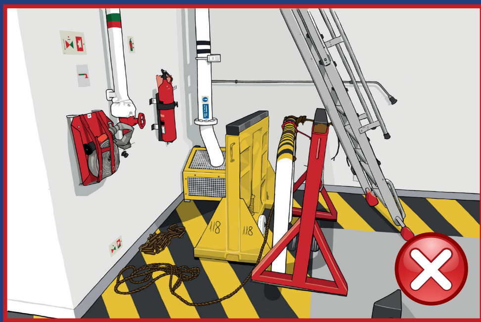
Do not obstruct emergency equipment on RO-RO spaces and/or vehicle decks