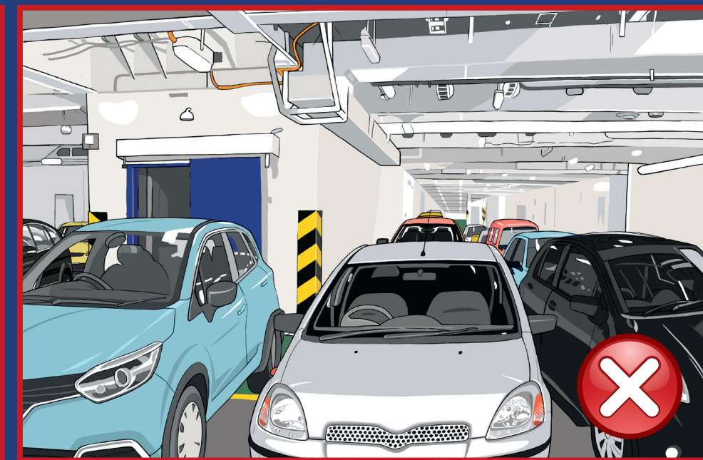
Do not obstruct escape routes on RO-RO spaces and/or vehicle decks